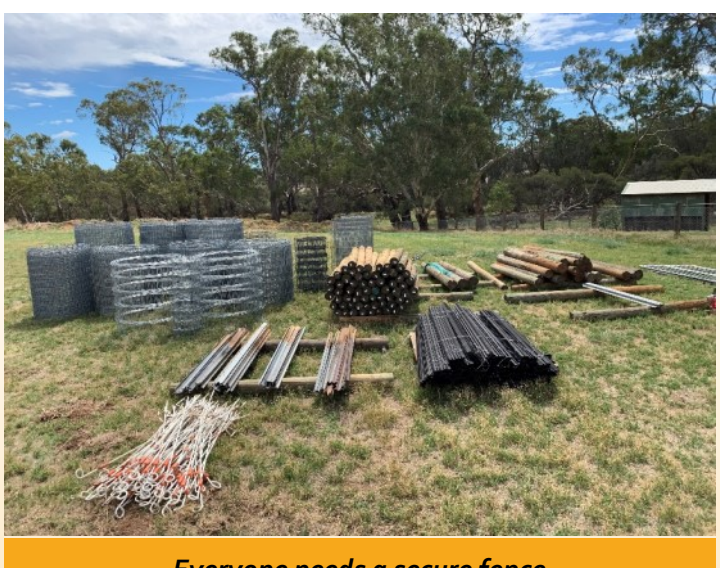
Everyone needs a secure fence

Rotary's BlazeAid support commenced as they were setting up at the State Equestrian Centre where the WIFI Pro Bono network was installed and support such as cooking dinners, providing office equipment, and fencing supplies to affected people.