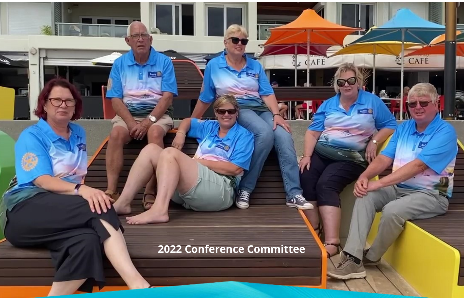
2022 Conference Committee