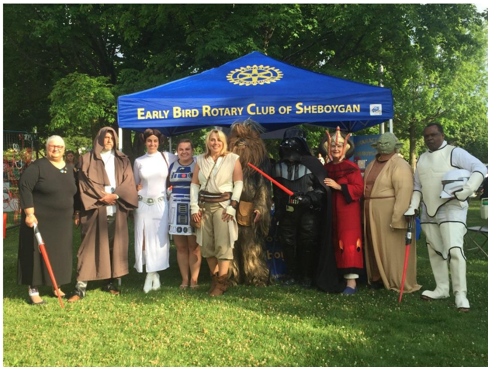
WHAT WE DO FOR ROTARY- SHEBOYGAN EARLY BIRD'S LOBSTER FEST TABLE CONTEST