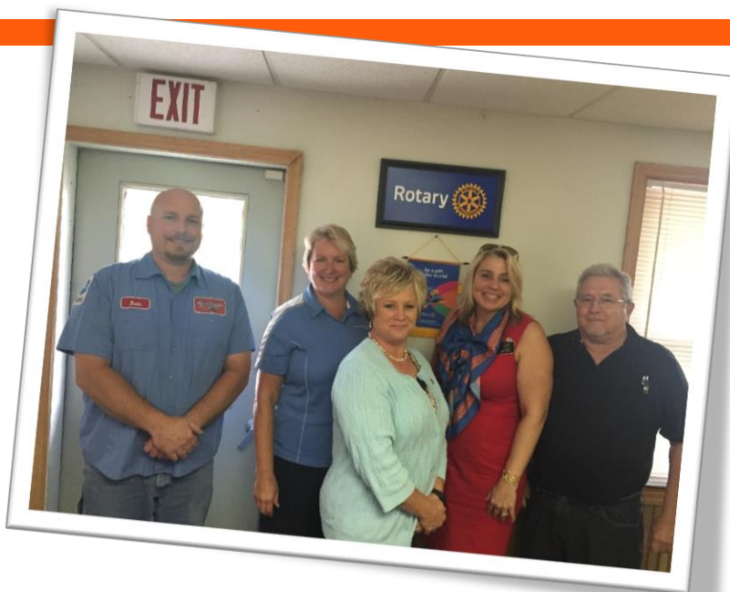
Montello Rotary Club

Berlin - The whole club was so engaged and energized about the new Strategic Plan. The club is excited to be a candidate for the new strategic plan for membership. They are planning to come to the District Conference as a group. Their newest member has even agreed to join them at District Conference. Go Berlin Rotary Club!