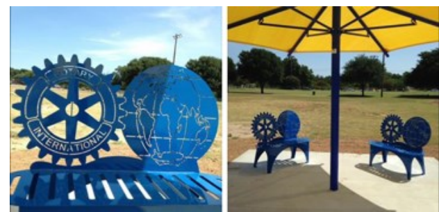
Rotary benches and shade at the newly completed skateboard park in Fredericksburg.