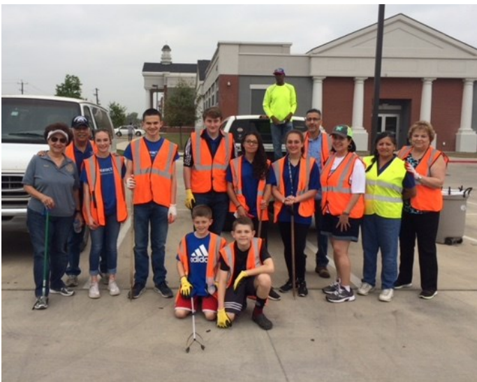
Five Winston Interact members participated in the San Antonio South Adopt a Highway Project on March 17, 2018. The cleanup project covered about three miles along S. WW White Road on the Southeast side of San Antonio.