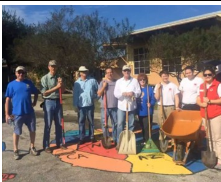
Members of the Rotary Club of San Antonio and City Year Corp members were hard at work on November 12, 2016 beautifying the landscaping around Dorie Miller Elementary. Dorie Miller was the site of the Rotary club's 15th Kingdom for Kids build.