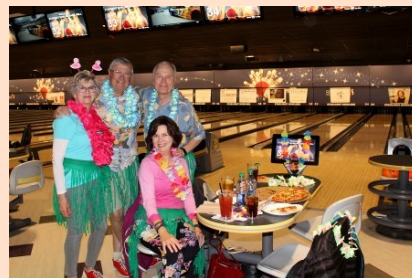
Del Norte Rotary’s Hula-Hula Team enjoys a break in the action at Pins for Polio Bowling Tournament.