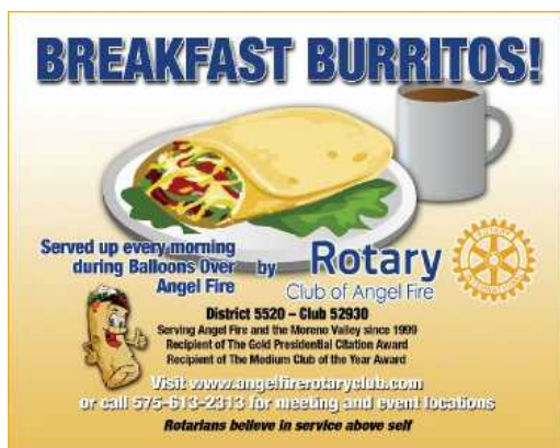
Angel Fire Burritos Event, June 15-17