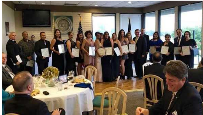
Twenty Charter Members of the new El Paso Zaragoza Rotary Club.