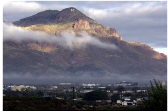
Socorro, New Mexico: home of New Mexico Institute of Mining & Technology.