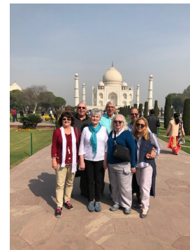
RFE Team in India, in front of the Taj Mahal.