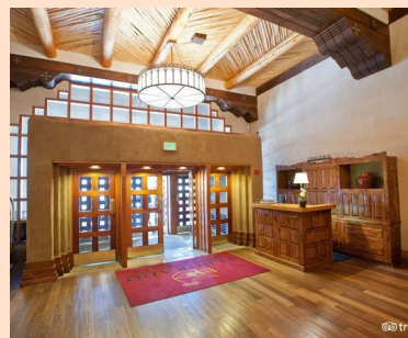
Foyer of the El Dorado Hotel & Spa, host facility for the 2018 District 5520 Conference in Santa Fe.