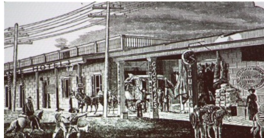
The Plaza in Santa Fe in the early 1800's.

Almost all were built by the early Jewish traders, most of whom had emigrated from Germany to the U.S. and then crossed the Santa Fe Trail in the early/mid/late 1800s. These buildings stand as a legacy of the travelers who came to the New World from the old European world in search of a new life and, hopefully, their fortune. Some of the buildings still carry the family names; look for them as you wander the Plaza.