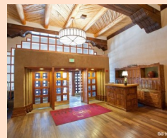
Lobby, Eldorado Hotel

Free time activity options for an additional fee: