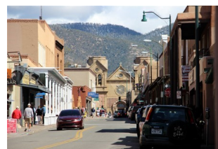
Santa Fe: City Different