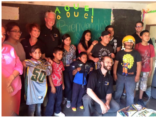
Rotarians from El Paso Camino Real and Los Alamos STAR Satellite Club visit needy kids in Juarez, Mexico. Both clubs are joint partners in their international project.