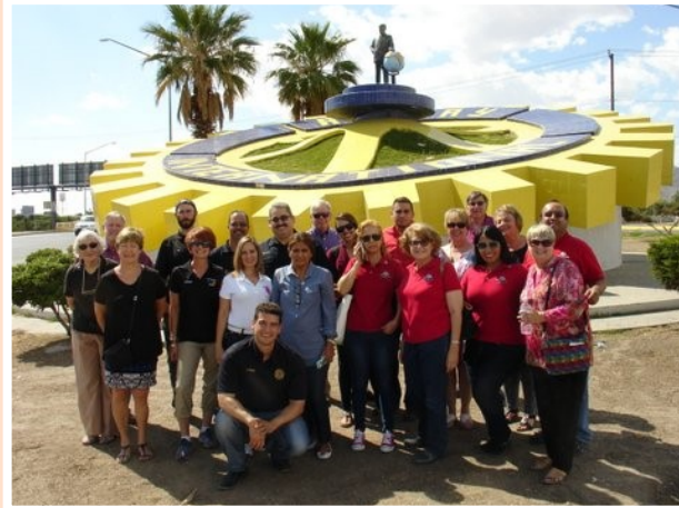
Rotarians from Juarez Integro, Albuquerque Del Norte and El Paso Camino Real clubs gather around "the world's largest Rotary wheel," after a day of touring various joint projects as part of joint international projects being conducted in Juarez, Mexico.