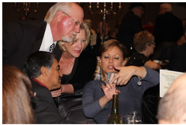
Albuquerque Del Sol Rotarians gather around Gov. Susana Martinez showing off some of her photos at the Annual Governors' Charity Ball which raised money for three children's charities in New Mexico in May.