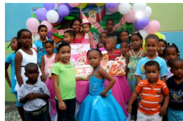
School children in Cumajon, DR