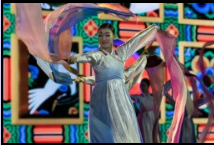
Korean dancers perform for the 107th annual Rotary Convention.

Some 45,000 Rotarians gather from around the world