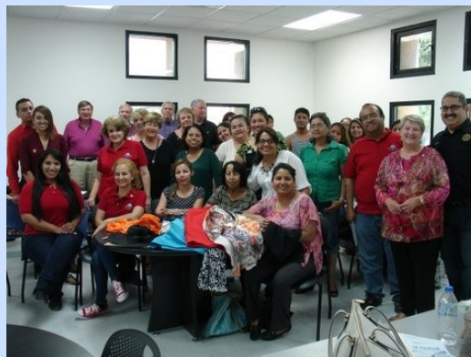
Visiting Rotarians pose with mothers in their sewing class in Juarez, Mexico, a joint project of the Club Rotario Integro in Juarez and Albuquerque Del Norte Rotary in the US.