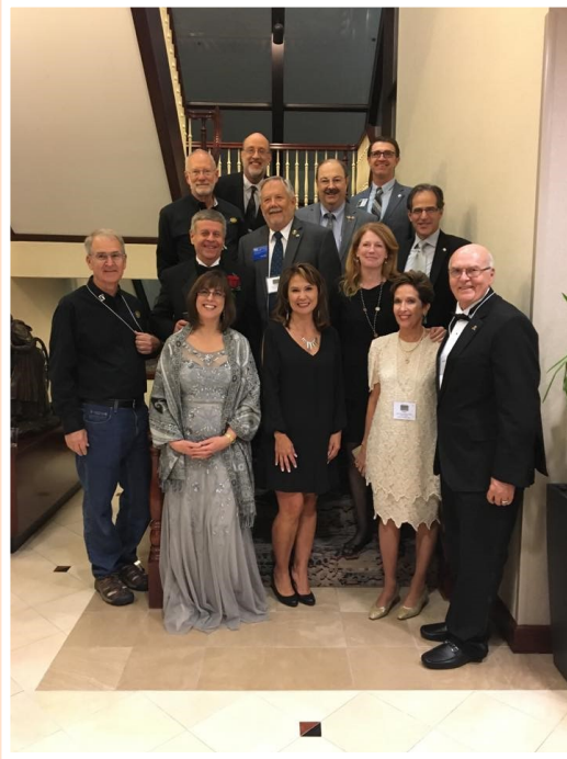
Attendees from District 5520 at the Zone Institute held in Salt Lake City.