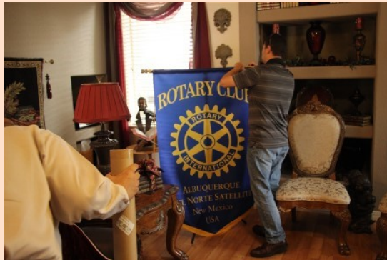
A new banner for the Albuquerque Del Norte Satellite extension goes up to make it official. Some 11 members now form the host club's new venture.