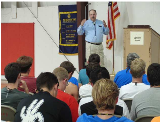
Speaking at Gov. Tom's favorite stop: RYLA Camp.