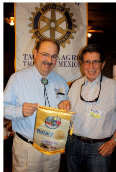
Presentation of a club flag at Taos-Milagro.