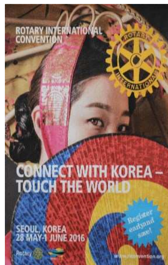
Cover of brochure promoting the 2016 RI Convention