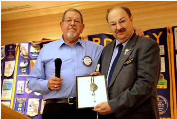
A special Rotary bolo tie from Del Norte Albuquerque.