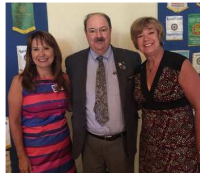
In Roswell, always among friends!