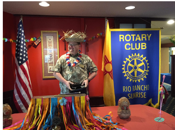
You have to get up early at Rio Rancho Sunrise.