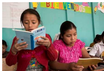
Global grants at work in Guatemala.