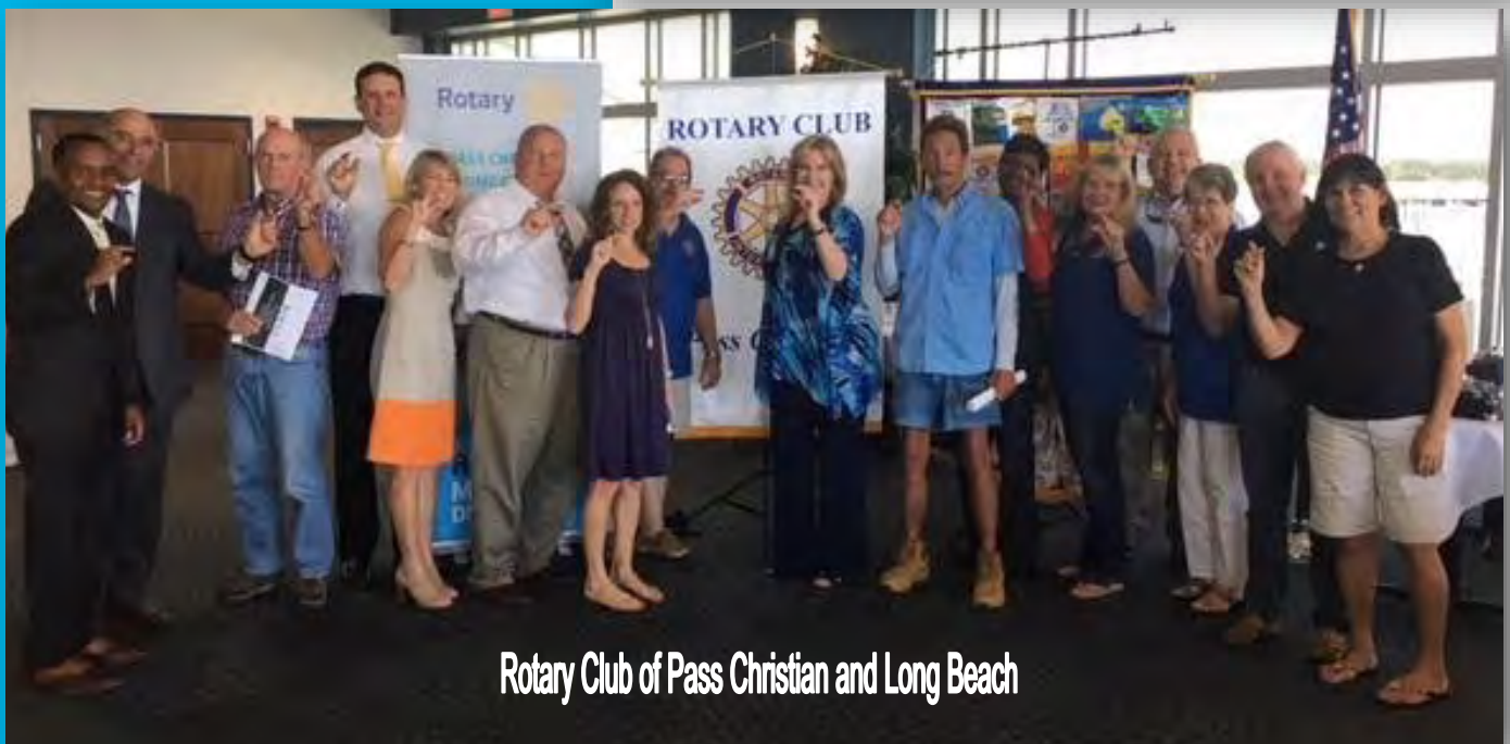
Rotary Club of Pass Christian and Long Beach