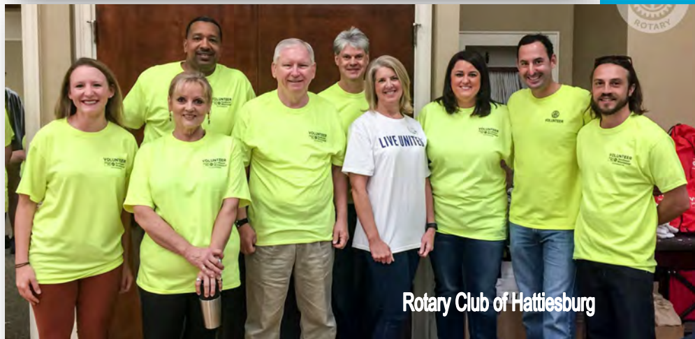
Rotary Club of Hattiesburg