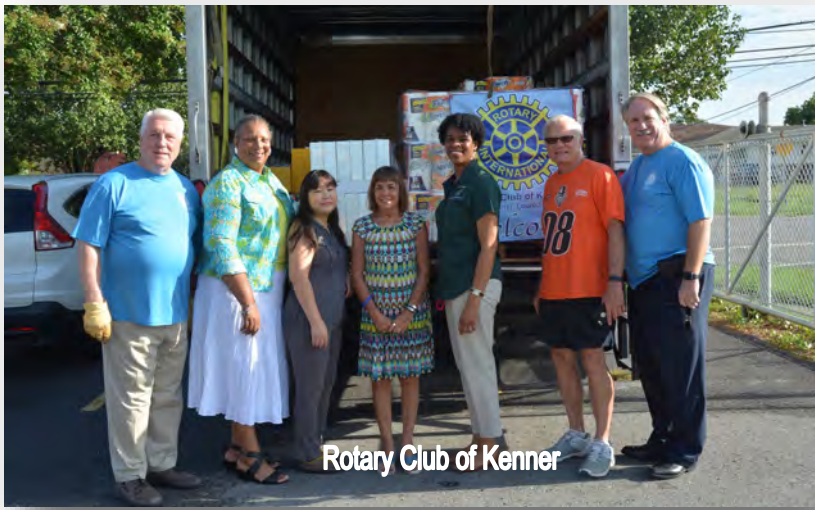
Rotary Club of Kenner