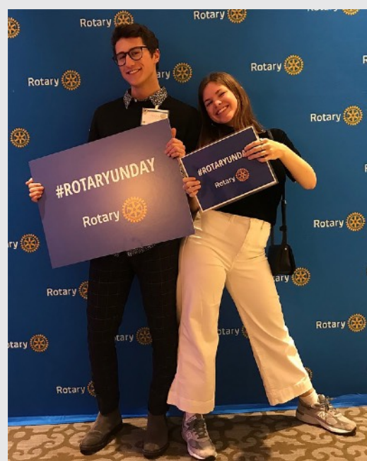
RYE Rebounds gain renewed passion for Rotary at the Rotary Day at the United

As for the Rotary Day at the UN, what an unforgettable experience!!! I was able to go with another rebound from Romania here at Columbia and we had a blast. All the speakers were truly inspiring and they definitely made an impact on my aspirations and thoughts going forward. I can't wait to share some of the things I learned and heard when I come back home in the winter. I met so many Rotarians from all over and truly made some connections I never would've dreamt of had it not been for Rotary! My friend and I are looking into chartering a Rotaract chapter here at Columbia, and I am also looking into joining the Rotaract Club of the United Nations! Wish me luck! I've also included some pictures for you below from the event for you.