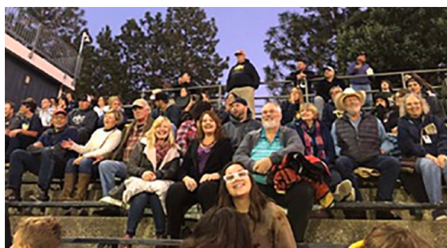
Nevada Union and End Polio Now fans

Welcome to Foundation Night Nevada Union High School style! Nevada Union Football has a long standing tradition of taking time to recognize one of the many dedicated non-profits in Nevada County. This year they chose to recognize Rotary International and the Rotary Clubs of Area 4 and District 5190. Rotarians in our community go to great lengths to support Polio eradication efforts through Rotary International. All Rotarians in attendance were asked to stand for a moment to be recognized for this life-saving work.