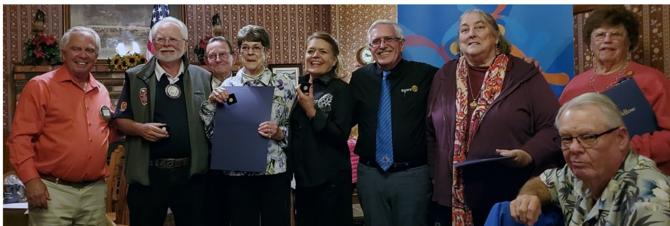
Rotary Club of Smith Valley Paul Harris recipients