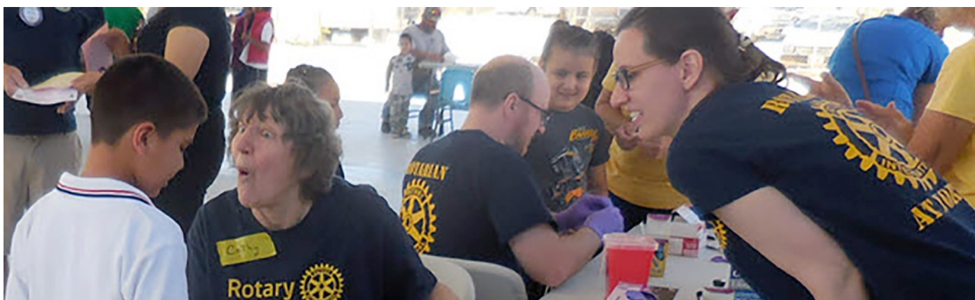
Rotarians sooth fears during blood testing at the Los Barrels project