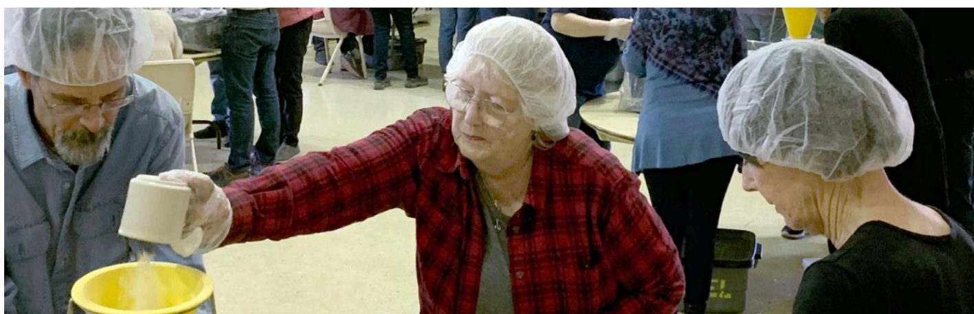
Hunger doesn't have to exist - let's end it together

On Saturday, January 11, the Rotary Club of Bishop and Rotary of Club of Bishop Sunrise joined together to host the Rise Against Hunger food-packaging event at the Methodist Church in Bishop. The event was promoted in The Inyo Register inviting the general public to help. A number of non-Rotarians participated to bag 10,000 meals in just a couple hours.