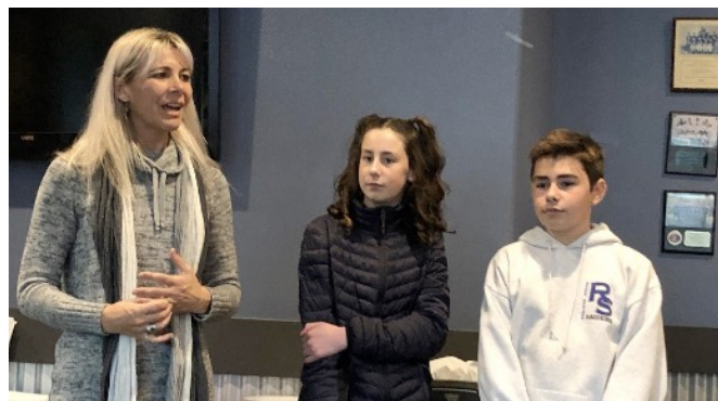
Breaking Down the Walls strives to unify, empower and engage students to create a positive and supportive campus.