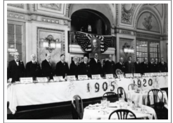
Rotary celebrating its 15 th Birthday. If we could party this hard in 1920,

Rotary Promotes Peace Through Service In All the Places We Go!