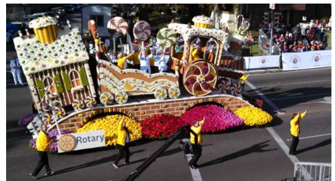
Rotary Float turns the corner on Colorado Blvd.