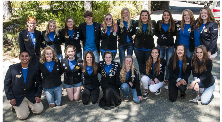
Photo of outbound students