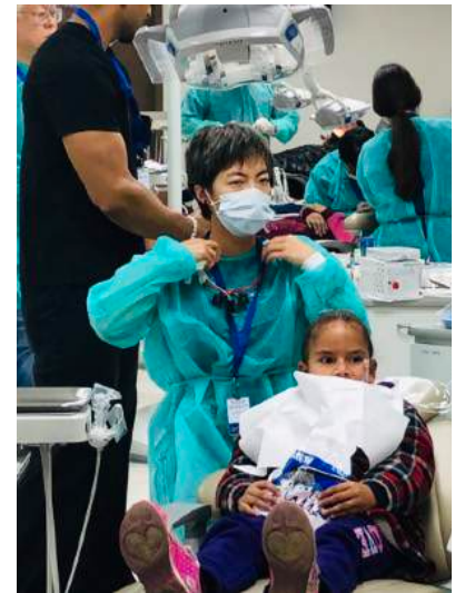
Volunteer DDS from Southern California treat a young patient

In short order, District 5190 raised funds and presented them to the Smiles Without Borders Foundation in Ensenada, Baja California, Mexico. The gift was then redirected to the Thousand Smiles Foundation which provides free life-saving surgeries to children so that they can eat properly, speak normally, and be more accepted in their communities. If you would like to know more about the Thousand Smiles Foundation check out https://thousandsmiles.org .