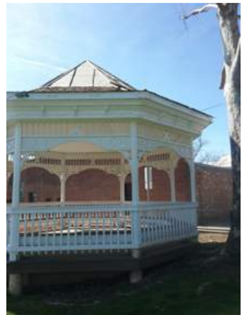
McGee Park Restoration and Improvement Project by Plymouth Foothills 2017-18