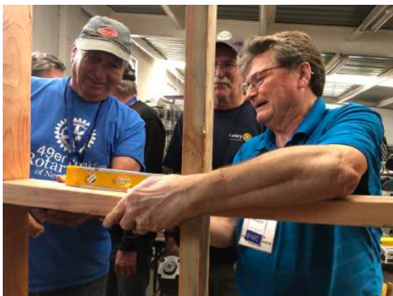
District 5190 volunteers team up and construct a new computer office

The Thousand Smiles Foundation is in the later stages of building a new clinic.