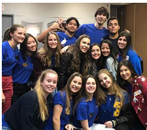
Inbound Orientation Day

One of the ROTEX students said that her way of dealing with her return was to treat it almost the same way she approached her exchange when she went to her host country. That is, she kept her mind open as if to a "new" experience upon returning. Even though returning to her family, home,