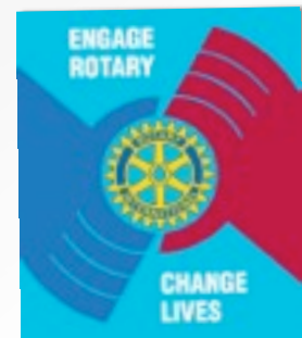
IT'S UP TO YOU