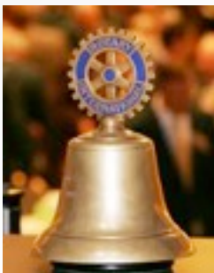
LIVING THE DREAM