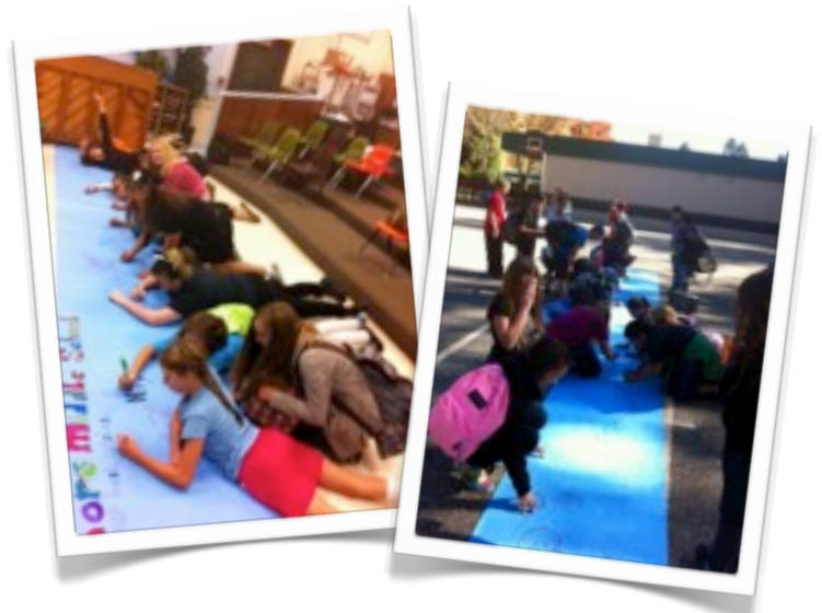
During their lunch breaks 5th through 8th grade students at Lyman Gilmore Middle School stopped to write messages of support