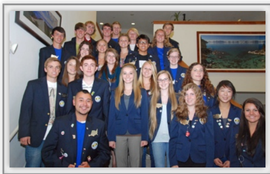
D5190 RYE Outbound Class of 2012-13

Twenty five students are spending the school year in Argentina, Austria, Belgium, Brazil, Chile, Denmark, France, Germany, Italy, Poland, Slovakia, South Korea, Spain and Thailand.