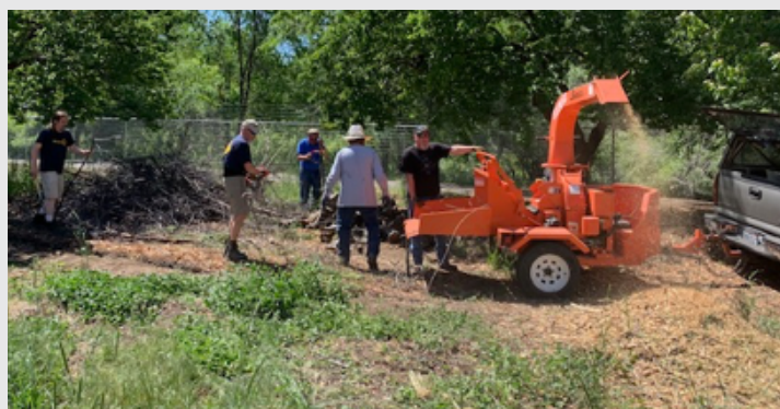
Susanville Sunrise - Community Garden 2018 - 2019

District Grants are a wonderful opportunity to put your Foundation dollars to work! Apply today!