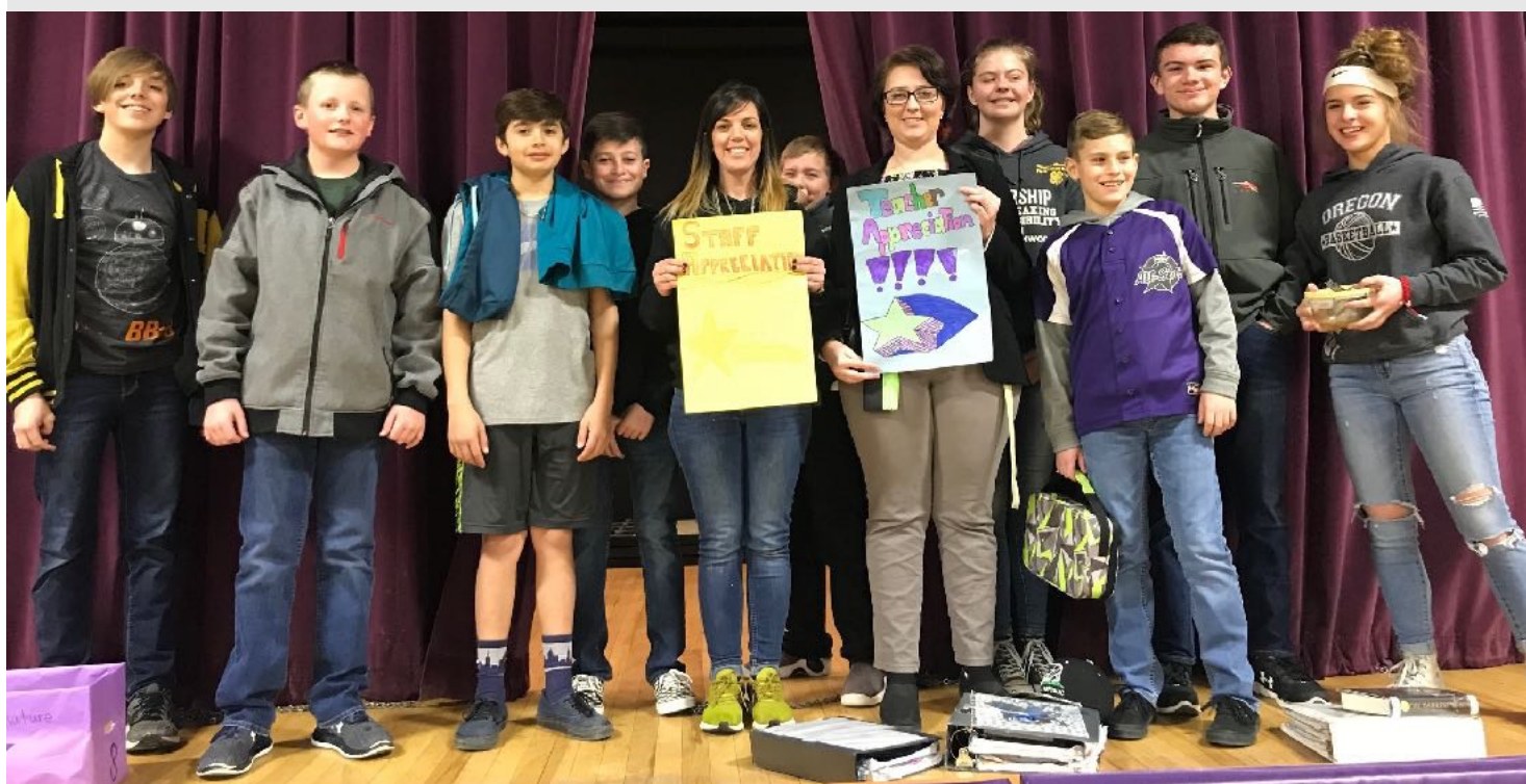
Modoc Middle School Interact Club honor Teachers and Staff during assemblies throughout the school year

Any Interact Club members may attend these trainings