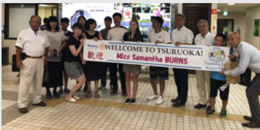
Outbound to Japan is met by a large Rotary group. Beginning of her year in Japan looks promising.