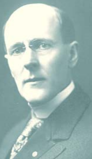
PAUL HARRIS ROTARY FOUNDER

You can also give online at www.syracuse.com/oldnewsboys and choose the appropriate club from the drop down!