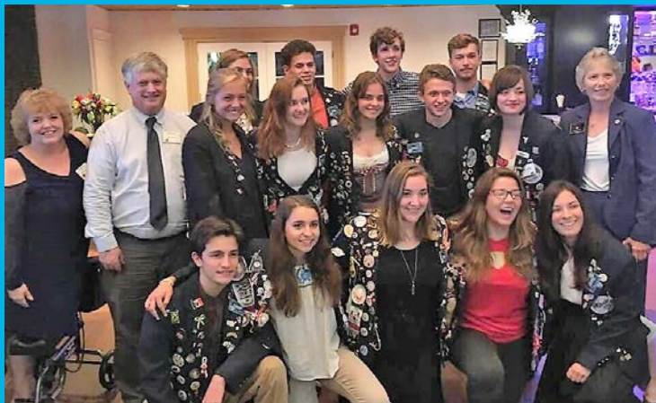
The 2017/18 Class of Outbound Youth Exchange Students

On Wednesday, August 1st, in a packed room at the Fireside Inn in Baldwinsville, Rotarians, families and students gathered to hear about the experiences of our recent class of outbound Youth Exchange students. In addition to words from the District Youth Exchange committee on the value of exchange, students who just returned from a year abroad shared tales of their time away. The overarching theme was that while there are many challenging moments during exchange, they encourage growth and maturity that makes the experience worth every minute.