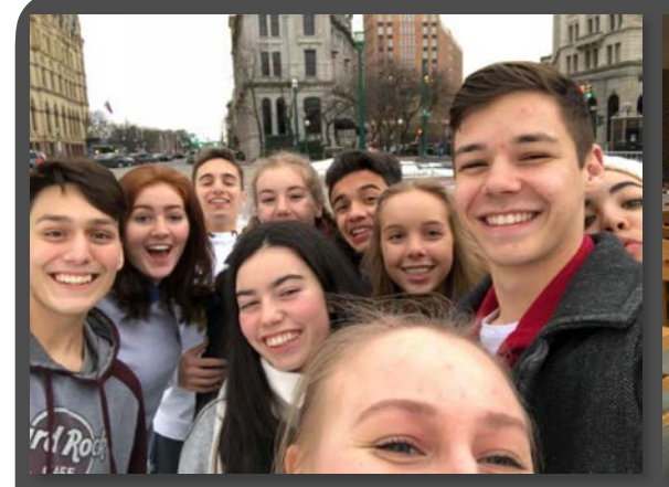
The current inbound group of Youth Exchange Students from all around District 7150 got to visit Clinton Square in downtown Syracuse to do some ice skating.