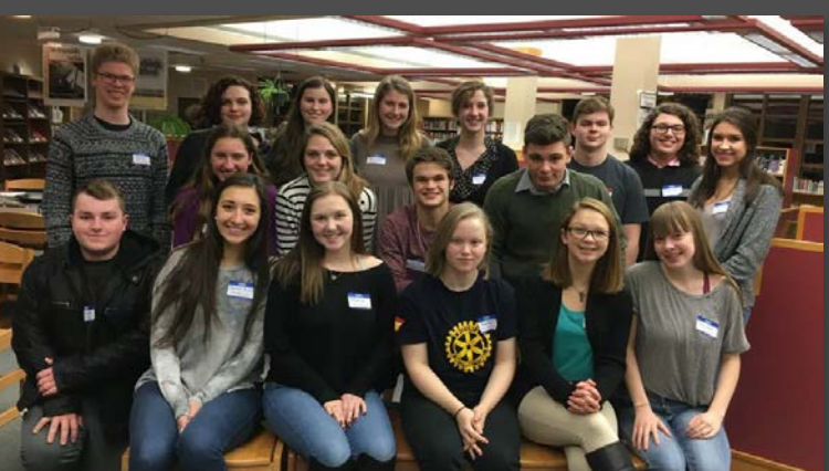
The YE committee led a weekend of orientation for the class of students going outbound next fall. The current students helped the future exchange students work on their language skills!