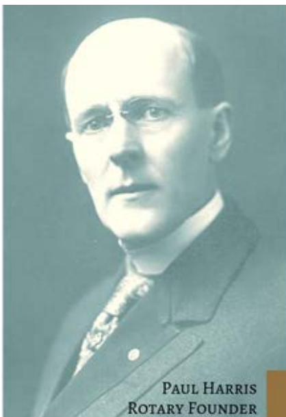
PAUL HARRIS ROTARY FOUNDER