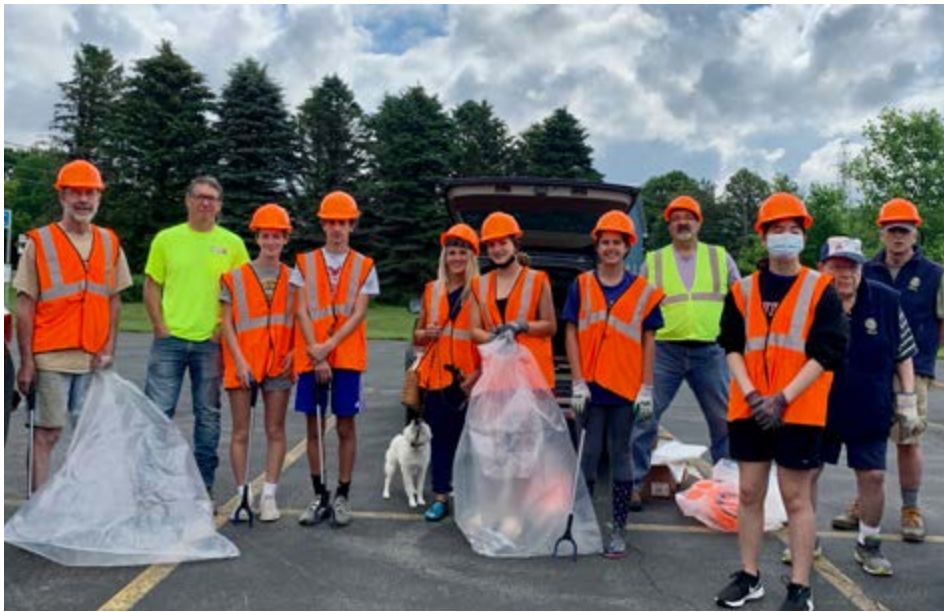
Tully Rotary and Interact members spent a recent Saturday morning picking up trash along Route 11 in Tully as part of the Adopt-A-Highway program. "Doing our part to keep the community clean and safe".

Just remember that you will need to do this yourself — your club leaders cannot help you with this one — and that you will still also need to make sure it gets updated in ClubRunner one way or another. Hopefully no one is having to update their email address very often, but it is important that all members know about this one little work-around that is necessary if you do! ♦