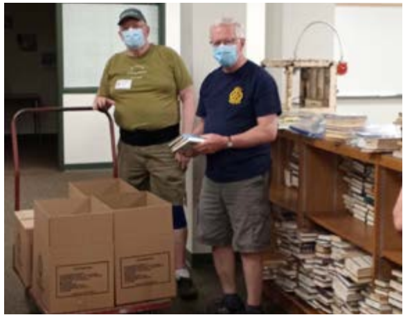
It's that time of the year as Auburn Rotarians pack and move their first pallet of books for the Books For The World project. These books were donated courtesy of Auburn Senior High School. This is the first of four pallets of books scheduled for the project this summer.

Auburn Rotary kicks off summer with first pallet of books