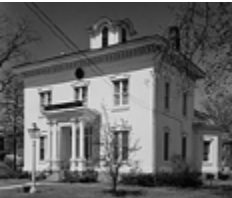
The 1857 Gleason Mansion, also known as Liverpool Village Hall, is listed on the State and National Registers of Historic Places. The museum collection includes artifacts, photographs, and information about the people, places, and events of Liverpool.

Members of the Liverpool Satellite Club teamed up with the Greater Liverpool Chamber of Commerce to do a little refresh of the landscaping around the village's Gleason Mansion (the chamber's office building). They, along with some Baldwinsville Rotarians, weeded, planted, mulched and painted to make everything beautiful again. A great service project to end the Rotary year on a high note!