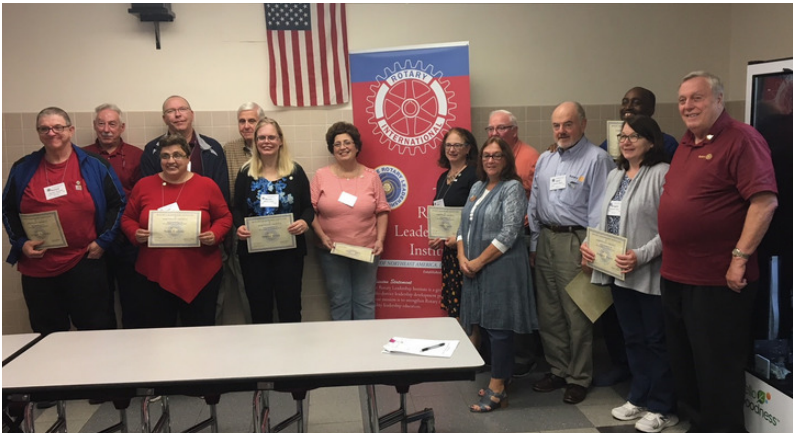
Congratulations to the Rotarians who graduated at Rotary Leadership Institute in Verona on September 22 , 2018!

You are correct. The District Grant process for 2020 doesn't begin for a few more months with the District Grant seminars, but there are things for you to consider at the club level before those meetings come around. First, remember the scope of the District Grant. These are funds for small-scale, short-term activities that address needs in your community or in communities overseas. Right now your club can be doing research. PLAN the project! Talk to Rotarians, neighbors, family. Attend local meetings of non-profits, government, or the like. Identify the two (or more) club members who will attend this year's Grants Management Seminar. Choose a Rotary Club partner – this is a requirement for a 2020 grant in our district. Consider carefully how Rotarians will be involved in the project and how Rotary's involvement will be publicized with proper branding. Be absolutely certain that NO FINANCIAL TRANSACTIONS have occurred before the grant request has been approved by our District Foundation and by the Rotary Foundation. And, lastly, work now to satisfy our District requirement for your club to achieve an average of at least $50 per capita contribution to the Rotary Foundation SHARE Fund. Start planning now for a successful District Grant outcome this year!