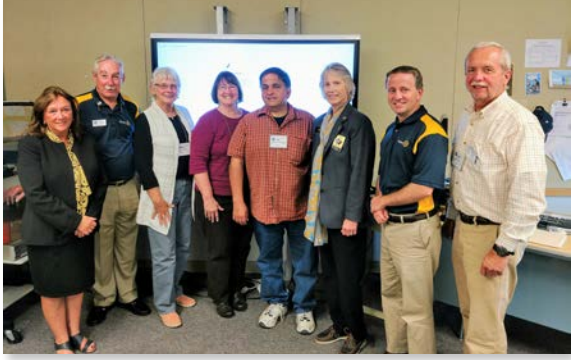
photo is this year's graduating class - congratulations! If you missed this session or are so inspired you want to fast track your courses, RLI will be in Rensselaer on October

21st and Canandaigua on November 4th. Register at <a href="https://www.rlinea.org">www.rlinea.org</a>.