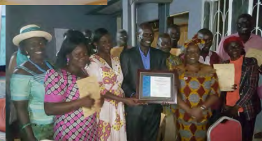
Rotary Community Corps of Nebbi received its charter certificated. It is sponsored by Rotary Club of Ggaba