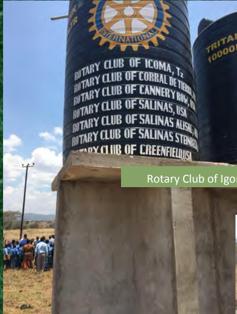
Rotary Club of Igoma Water Project