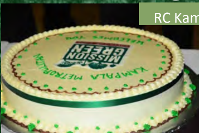
RC Kampala Metropolitan