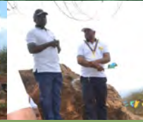
Dedication Day of the RC Same Water Project . The Freedom Torch Rally Leader handed over the project to the community