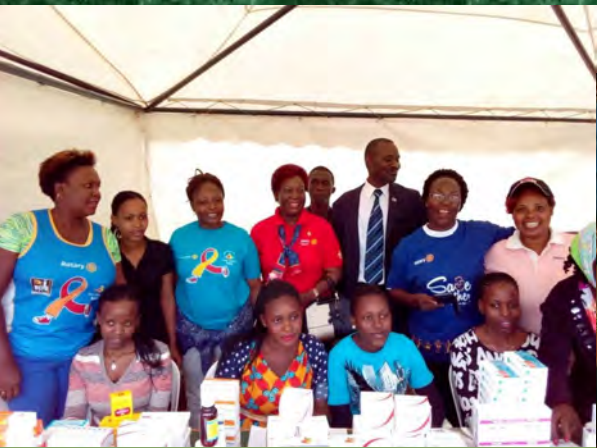
Rotary Club of Kampala Wandegaya Medical outreach