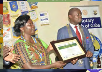
Rotary Club of Gaba