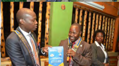
RC Kampala Ssese Islands