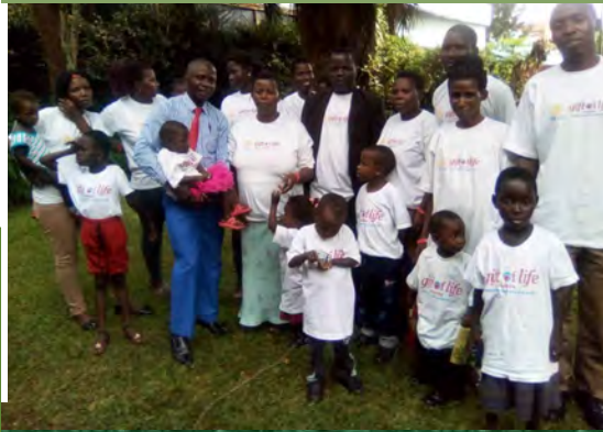
Rotaractors making a difference during the Earth Initiative Exercise in Gulu