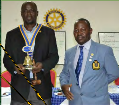
Welcome Rotary Clubs of: Njeru, Mbale-Metropolitan and Najjera. These were admitted to membership in Rotary International during the month of September 2017