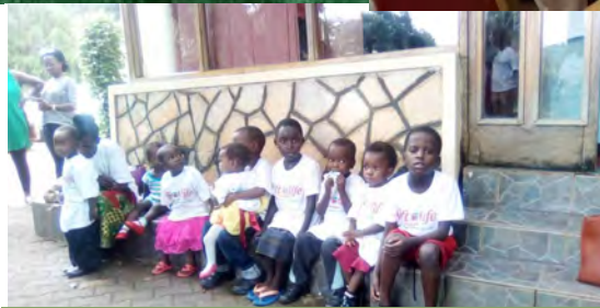
Beneficiaries of Open Heart Surgery on return

Rotary Uganda in partnership with Gift of Life Uganda sponsored ten vulnerable children drawn from central, western and northern Uganda for open heart surgery at Kochi Hospital in India. The children travelled to India on August 6, 2017 and returned on September 6, 2017 to rejoin their families. The project worth US$75,000 was funded by a Rotary Global Grant and implemented by the Rotary clubs of Hoima-Kitara and Dheli East End in partnership with Gift of Life Uganda. This project is in line with the Rotary Motto: "Service Above Self".