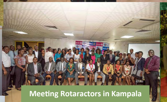
Meeting Rotaractors in Kampala