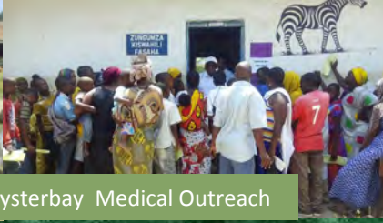
Rotary Club of Dar es Salaam, Oysterbay Medical Outreach