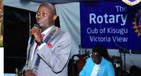
RC Kisugu Victoria View