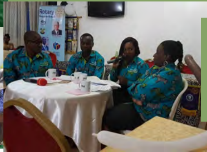
RC Bweyogerere— Namboole Buddy Group Zebra holding a studio fellowship on Basic Education and Literacy in September

Rotary Uganda in partnership with Gift of Life Uganda sponsored ten vulnerable children drawn from central, western and northern Uganda for open heart surgery at Kochi Hospital in India. The children travelled to India on August 6, 2017 and returned on September 6, 2017 to rejoin their families. The project worth US$75,000 was funded by a Rotary Global Grant and implemented by the Rotary clubs of Hoima-Kitara and Dheli East End in partnership with Gift of Life Uganda. This project is in line with the Rotary Motto: "Service Above Self".