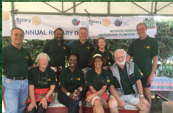
Members of Rotary Club of Arusha