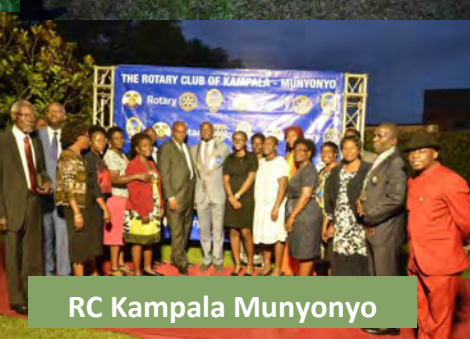
RC Kampala Munyonyo