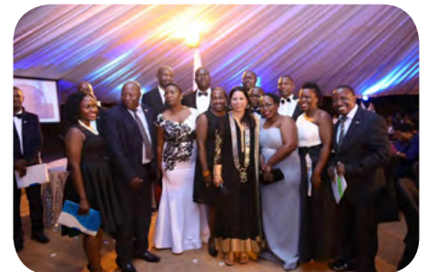
RC Bulindo Charter