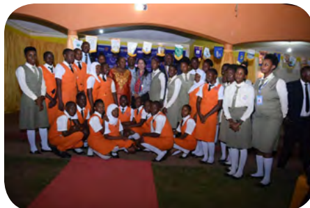
RC Mutundwe interactors