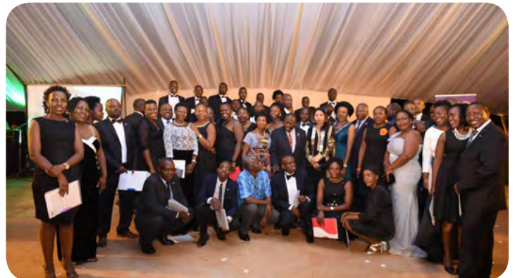
RC Bulindo Charter