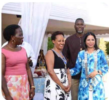
RC Kampala 7 Hills Charter