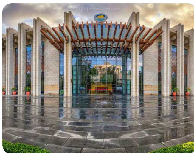
The Julius Nyerere International Conference Centre, the venue of the 94th District Conference and Assembly