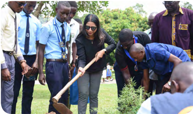
Planting trees at the RC Mengo Interact conference

CLICK HERE FOR MORE PHOTOS OF DG'S VISITS TO CLUBS.