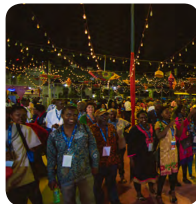
Rotarians watching the entertainment by Rotary Club of Dar es Salaam