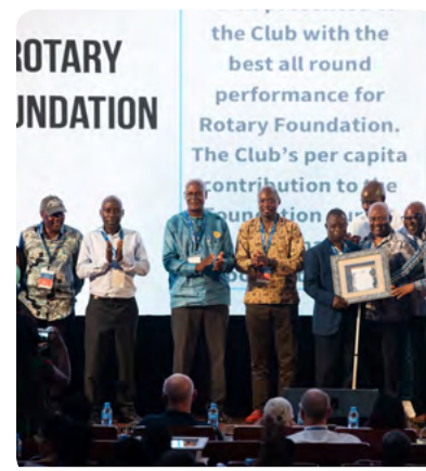
The Rotary Club of Muyenga took home the Rotary Foundation award