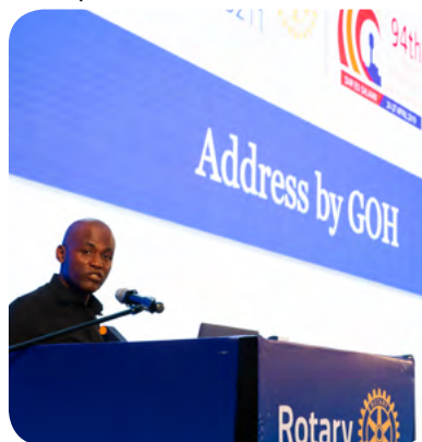
Hon Faustine Ndugulile, the chief guest representing the Vice President

The event was officially opened by the Hon Dr Faustine Ndugulile, Deputy Minister of Health, Community Development, Gender, Elderly and Children, who termed the work of rotary as very important for Tanzania's development efforts. He said he saw Rotary as a very important development partner for Tanzania and therefore assured the delegates that the government's doors are open to all Rotarians.