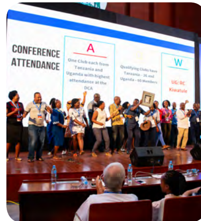
RC Kivatule with 60 attendants took home best conference attendance award