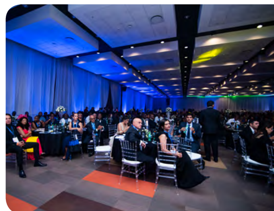
The Soweto String Quarter entertain guests; A cross section of the audience following the evening program.