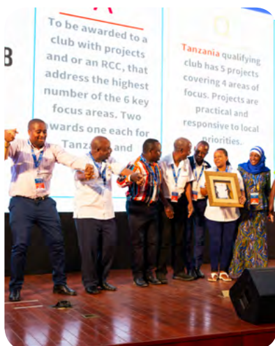
Rotary Club of Mvika of Tanzania took home the best club project