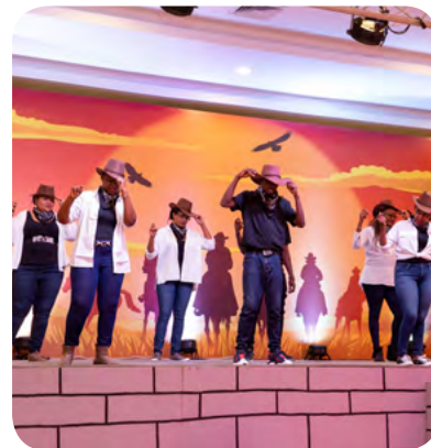
Entertainment by Rotary women in Dar es Salaam