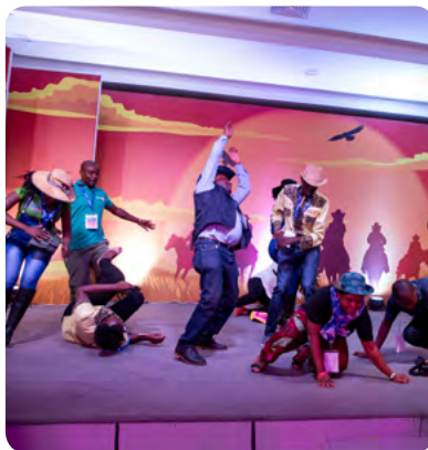
Rotarians have fun in a cowboy moment

During the conference, there were entertainment during the program. And the Rotaractors had their own beach party in one of the nights.