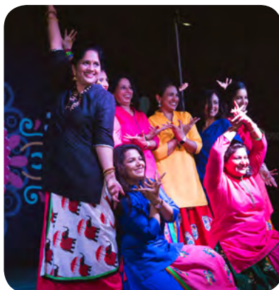
Entertainment by Rotary Club of Dar es Salaam