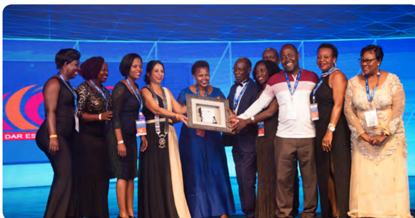
The Interact club of St. Kizito, sponsored by the Rotary Club of Kampala Ssese Islands took home the Interact Club of the Year.