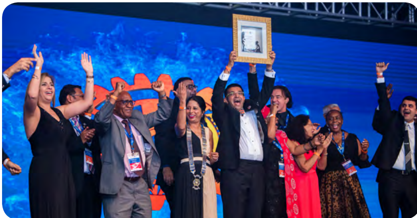
Rotary Club of Dar es Salaam Oysterbay took home numerous awards, including Rotary Club of the year