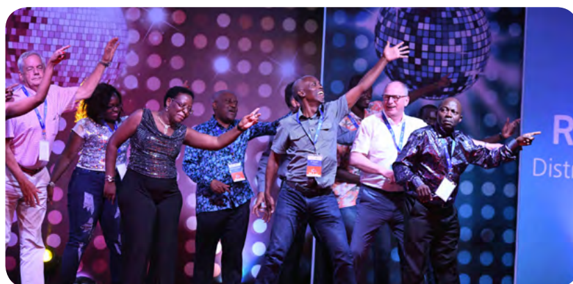
Past PDGs dance at the glittery disco night