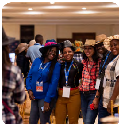
Rotarians have fun in a cowboy/cow-girl-themed outfit