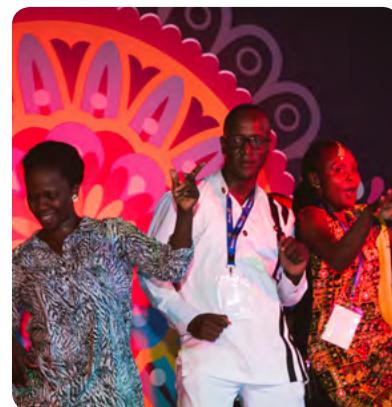
Rotarians enjoying the day