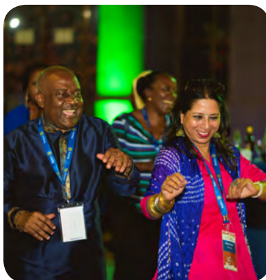
Rotarians enjoying the day