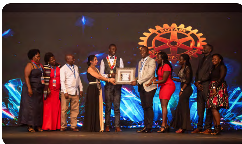
Rotaract Club of Bweyegorere-Namboole took the Rotaract Club of the year with 4 projects, covering 6 areas of focus