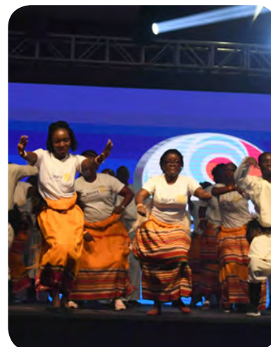
DGE's RC Kivatule dancing in joy