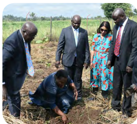
RC Gulu planting teak trees on 10 acres