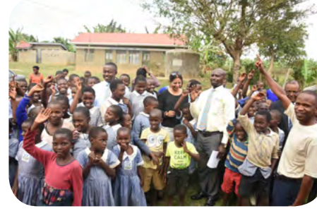
With children from Bushenyi primary school a inclusive school for children with differing abilities also nurtured by RC Bushenyi.