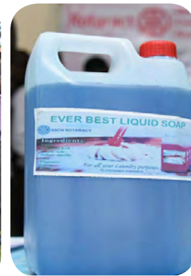
Liquid soap from Rotaractors of RC Soroti