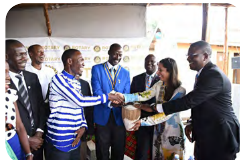
RC Mbale Metropolitan