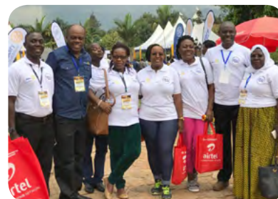
Some of the delegates

CLICK HERE FOR MORE PHOTOS OF THE FELLOWSHIP