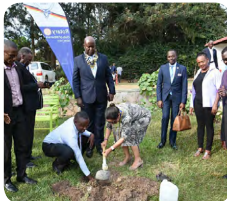
Planting trees with RC Mbarara