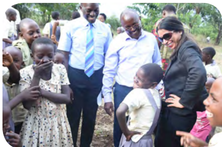
Rukoki primary school where children of different abilities is supported by RC Kasese