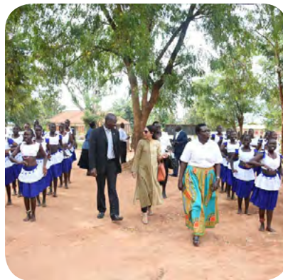
RC Kitgum celebrating launch of maternal health project