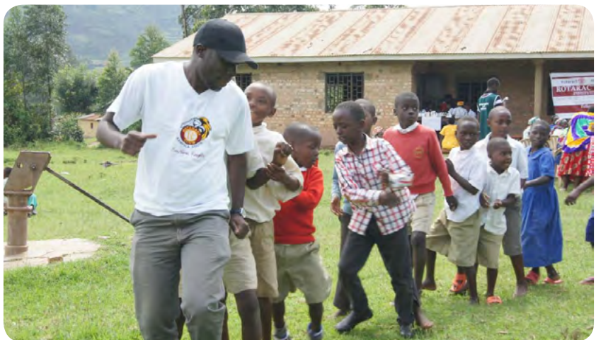
Nyakishumba Primary School pupils engage in a dancing session with members of the club

The project is estimated to cost UGX. Shs 15,000,000 (about USD 4,000) and will be executed between 21 -23 September. Those who would love to join and bear witness to the greatness of service, will pay a project fee of UGX 80,000 to cater for transport, feeding and accommodation.