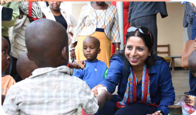
Toro babies home - this home looks after about 60 babies abandoned by the society and is supported by RC Kabarole.