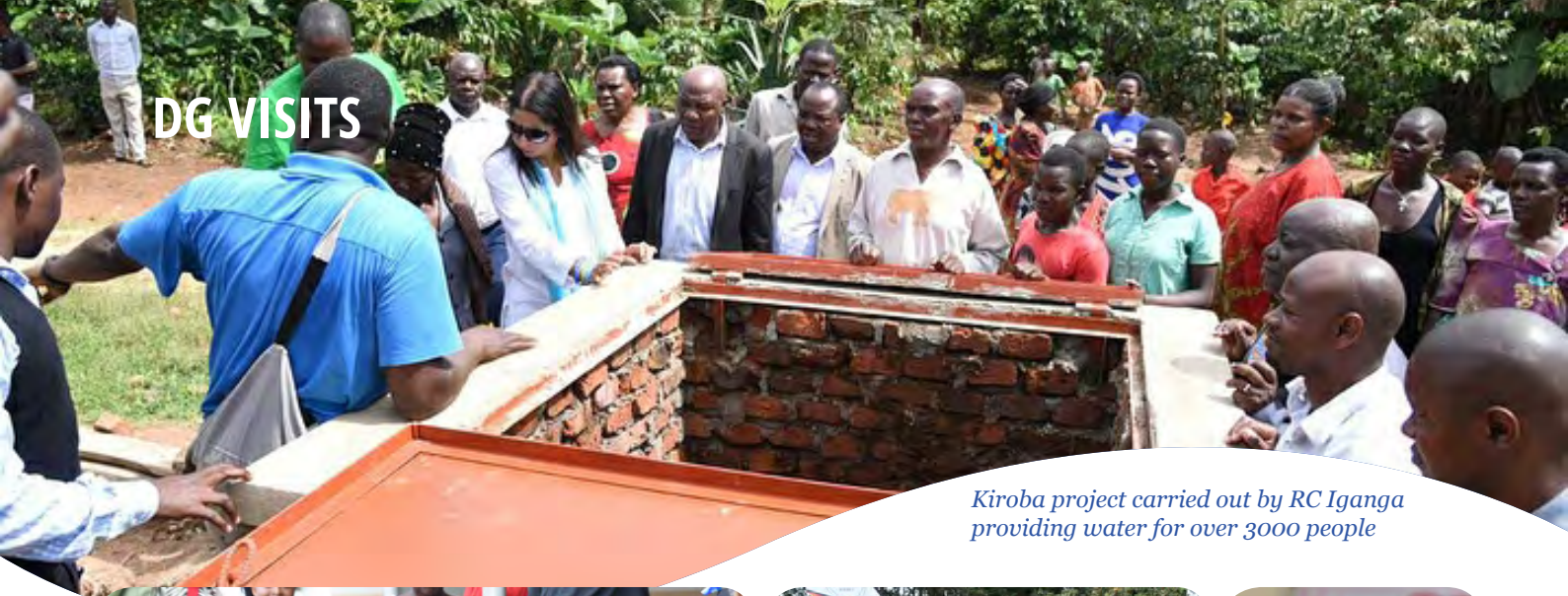
Kiroba project carried out by RC Iganga providing water for over 3000 people