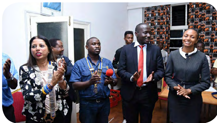
Inducting new members at RC Source of Nile