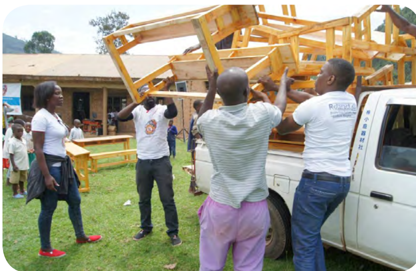
Desks donated by the club, being offloaded off the truck

The mission green project planted fruit trees in the school compound and donated some to the community. The Rotaract Club of Bugolobi donated maize seeds to needy individuals in the community - mostly the elderly. Nigiina shoes were donated to children aged 5 years and below. Re-usable sanitary pads were donated to girls in the community who also received training on how to use and make them and on menstrual hygiene. Contraceptives were donated to the community including male and female condoms and demonstrations on