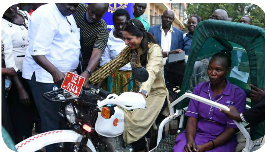
RC Kitgum motorbike for carrying pregnant women to maternal hospital from remote areas

CLICK HERE FOR MORE PHOTOS OF DG'S VISITS TO CLUBS.