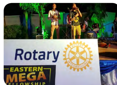
Entertainment was great!

All in all, it was a memorable fellowship with inspirational speakers, tremendous food, company and entertainment. Looking forward to 2019!