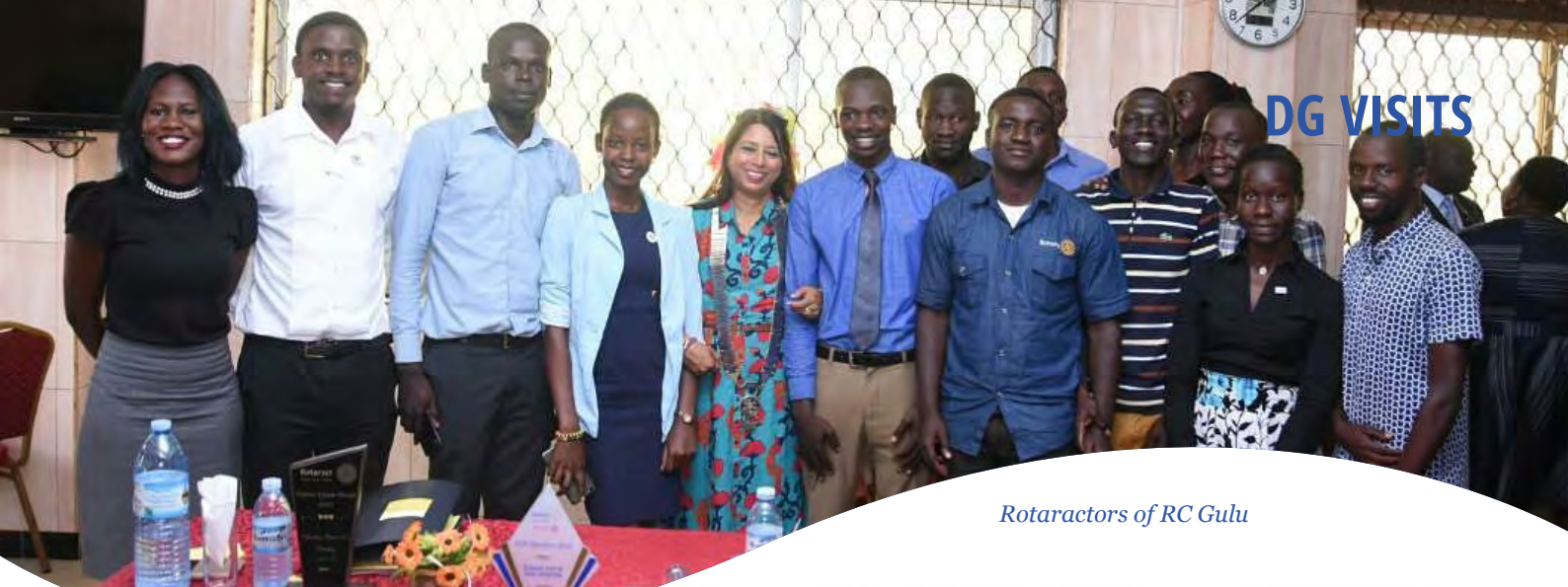
Rotaractors of RC Gulu