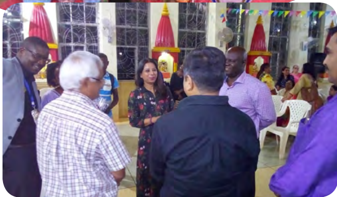
The Indian community in Mbale