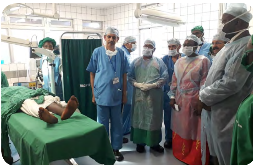
Hon. Minister of health Dr Ruth Aceng(middle) touring the theatre at the medical mission camp in Masaka