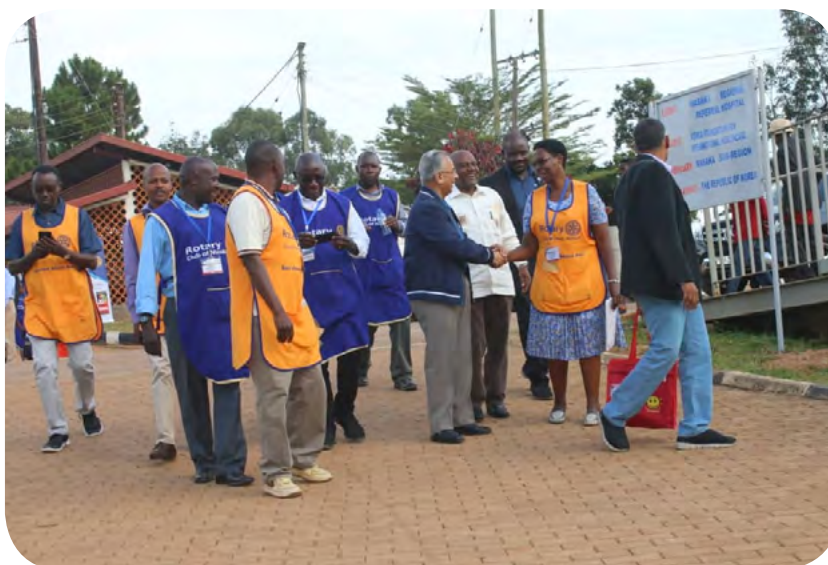
The warm welcome