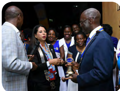
Chartering RC Bunga with 51 charter members