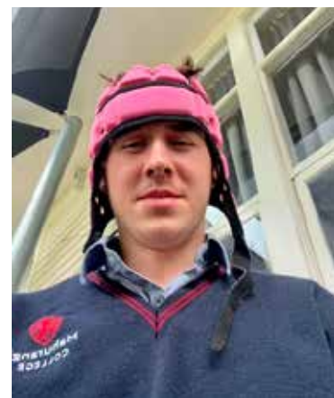
trying on a pink rugby helmet for fun at school