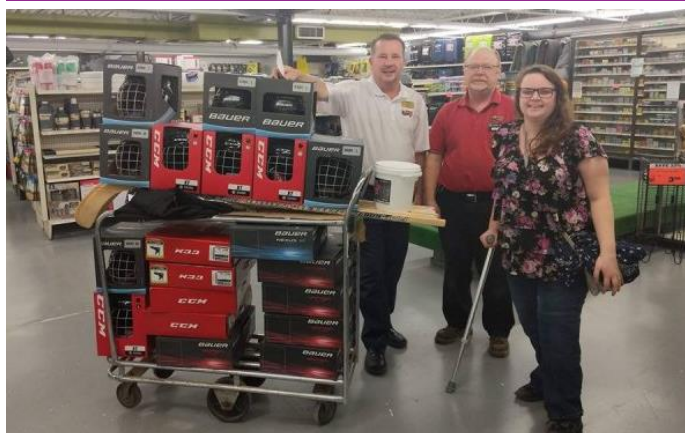
Thank you for $2000 worth of new hockey equipment made possible by Kingston Canadian Tire & generous True North Aid donors.