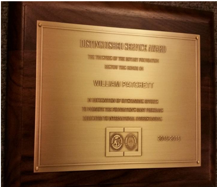
Rotary Foundation Distinguished Service Award