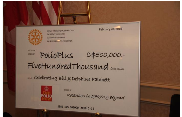
Cheque to PolioPlus for Cdn $ 500,000 & more is coming in