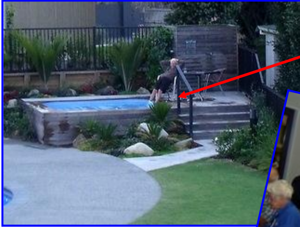
Jack W cooling his heels in the hot pool while we cooled our inner beings at 5s's