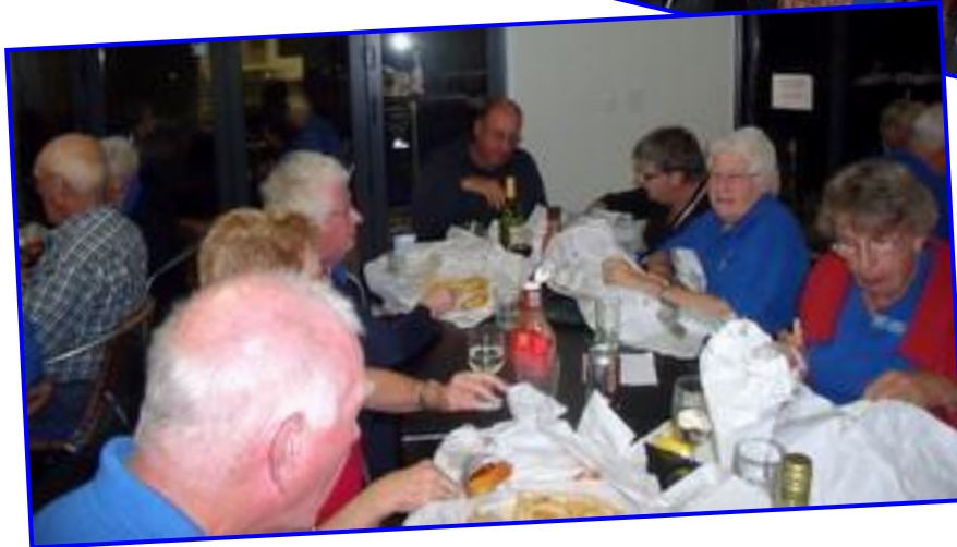
Sunday night's Fish & Chips. YUM!