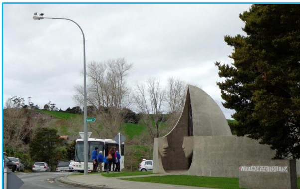
Hop On – Hop Off Bus