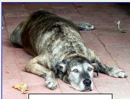
Bugger! It's hot!