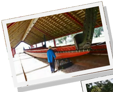
The waka at Waitangi