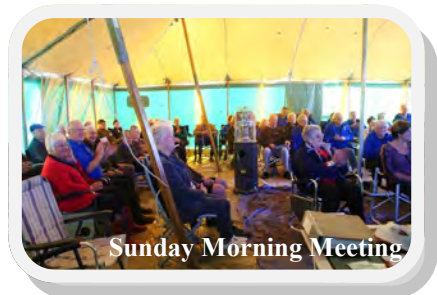
Sunday Morning Meeting

Sunday's meeting was comfortably held in the marquee. There were reports from the