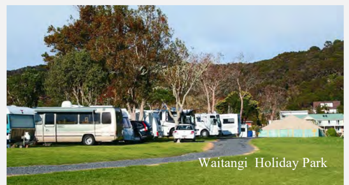
Waitangi Holiday Park