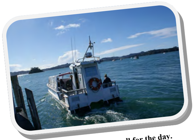
off to Russell for the day.