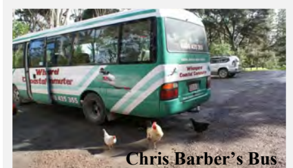
Chris Barber's Bus

5ss on Friday saw the marquee full and buzzing as 73 people caught up with the news. An Australian Rotary couple were the last van to be fitted into a very full camp and they joined us for some activities. Intervening supper on Friday evening was as usual a great opportunity to meet old friends and make new ones.