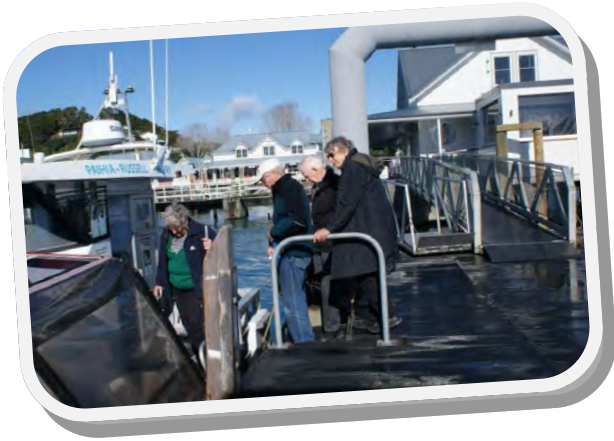
On to the ferry and .....