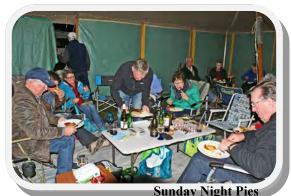
Sunday Night Pies

Monday morning at 8 the team assembled and de-erected the marquee. By 8.45 it was hard to imagine it had been there! Another excellent ICFR rally. As always there was lots of fun and fellowship.