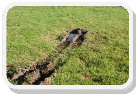
We left our mark