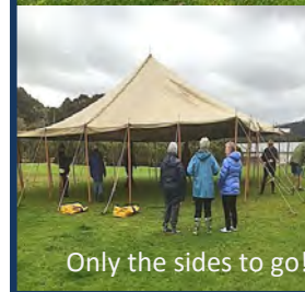
Only the sides to go!

under the sun umbrella reading the instructions and in no time we had a great meeting place. The grass was boggy and wet but Tim was able to source some Tar-paulins from the Trust to make us a carpet. The hired heaters kept us toasty.