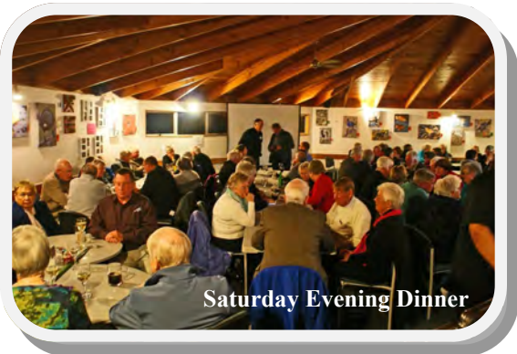
Saturday Evening Dinner

The organisers had a few challenges with the Saturday evening venue but we all had an excellent meal and the