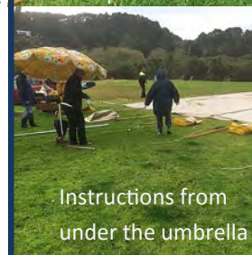
Instructions from under the umbrella