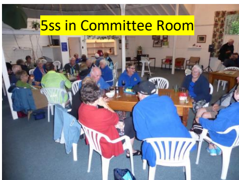
5ss in Committee Room

On Friday, our 5ss were held under the beautiful old trees near our campsite. The sun was shining and the