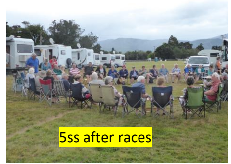
5ss after races

Monday was race day. We all had free entry into the delightful country race day. Most contributed to the TAB coffers! Our tree site was busy with race day people so we had 5ss near our vans. We were very entertained by a Hen Party Bride dancing in our circle. The weather was windy but still fine.