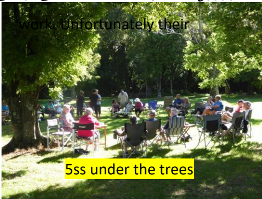
5ss under the trees