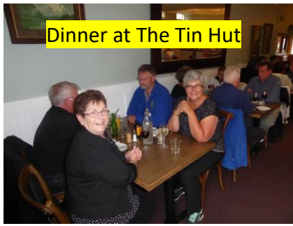
Dinner at The Tin Hut

The old tree site was used for 5ss again on Sunday.