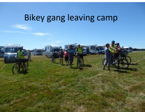
Bikey gang leaving camp

Twenty-six vans stayed for various lengths of time at the delightful Tauherenikau racecourse. The Wairarapa has many interesting places for us to explore.