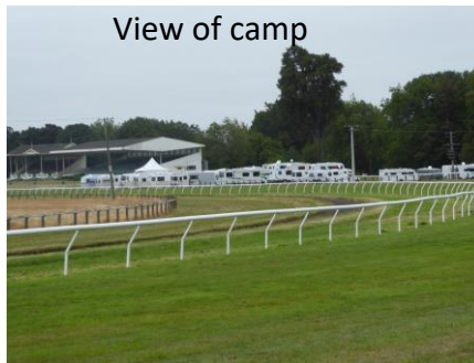
View of camp