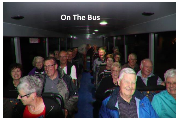
On The Bus