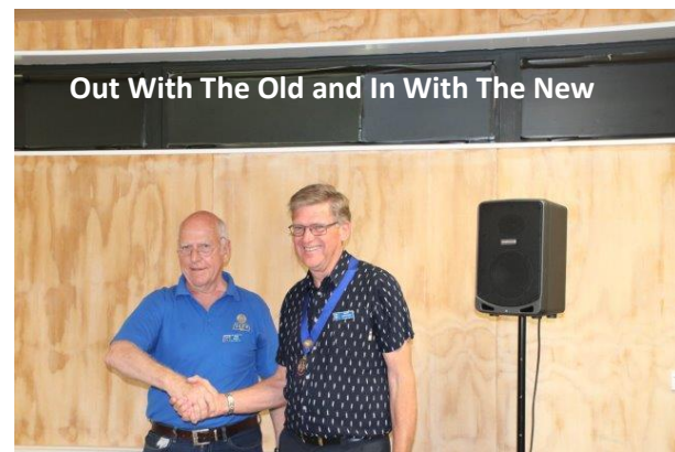
Out With The Old and In With The New

fine form and extracted a lot of money with much hilarity, which was to be donated to the Surf Club. We lunched back at camp in groups outside as the weather had improved. As it was a free afternoon some went