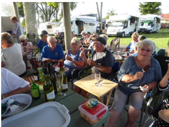
Pea, Pie and Pud followed by icecream

After another 4: 30 5ss we all had delicious pea, pie and pud meal . The pies were cooked by the excellent caterers at the RSA. Everyone took their own plate and cutlery to the BBQ area and it was a fun way to complete a very happy, fun filled rally. Thanks to Robin, Faye and Janice for all their hard work.