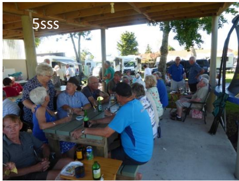
feels left out.