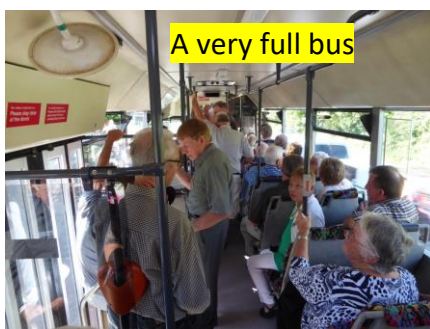
A very full bus

Tauherenikau while others had travelled straight to Upper Hutt. The laundry was very popular and a good meeting place as queues formed. Intervanning after dinner was as usual a chance to meet old friends and