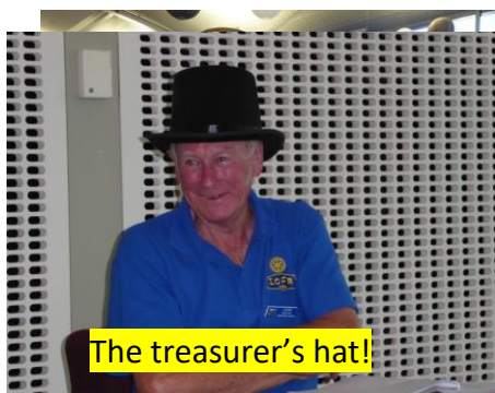
The treasurer's hat!

make new ones. The camp was buzzing as members found their designated van and settled in for supper and a chat.