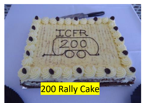
200 Rally Cake

make new ones. The camp was buzzing as members found their designated van and settled in for supper and a chat.