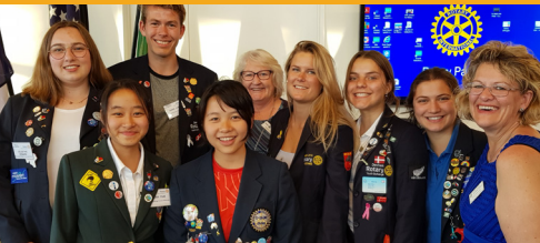
Our colourful Rotary International Youth Exchange student programme.

For over 100 years Rotary has been active in almost every country in the world. The ideals and goals are the same everywhere - peace, health, sanitation, clean water, care for the environment, growing youth into good citizens. The members of each club decide on their own priorities, often working with other clubs on projects.