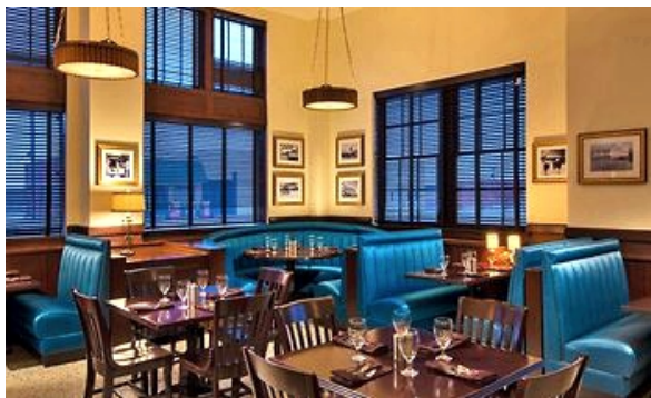
Hotel Settles 432-267-7500

The Hotel Settles, as featured in Texas Monthly, makes your stay enjoyable: a restaurant, the Pharmacy Bar which includes pool table, poker tables and separate sitting areas, a full-service spa which includes massages, body treatments and facials, an outdoor pool, a spa tub, and a fitness center.