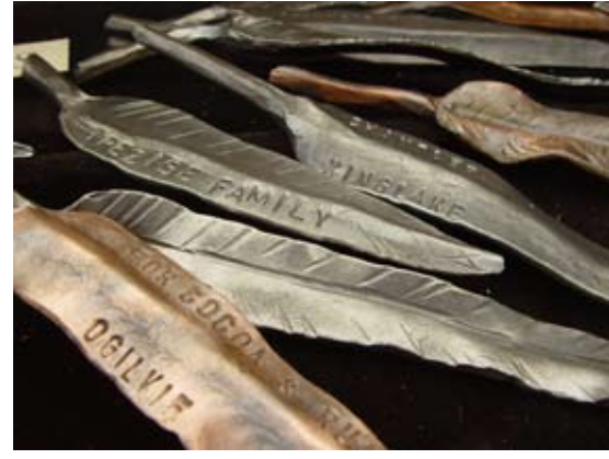
Follow the creation of the tree on the Tree Project website: www.treeproject.abavic.org.au