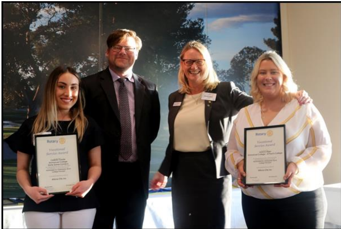
Fig. 1: 2019 Early Career Stage Awards