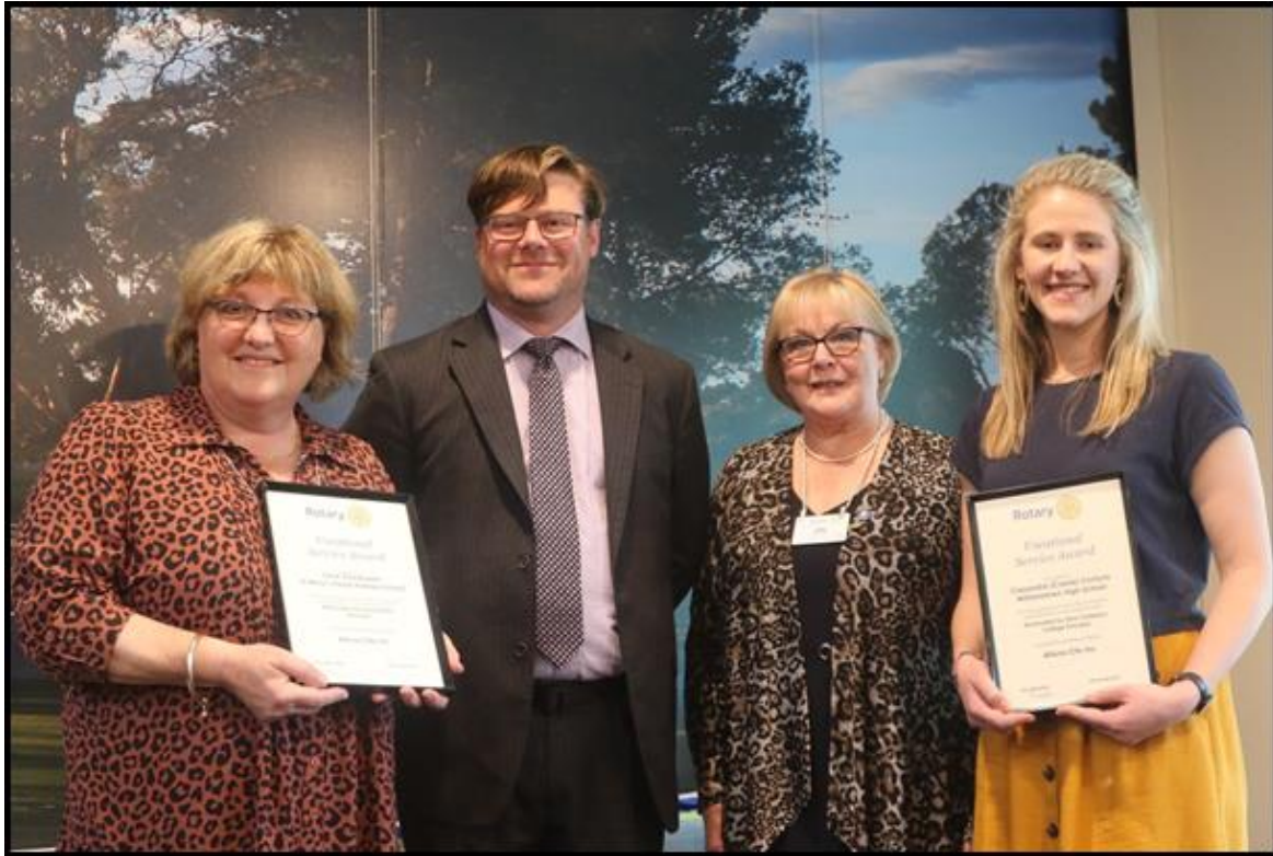
Fig. 2: 2019 Achievement Awards