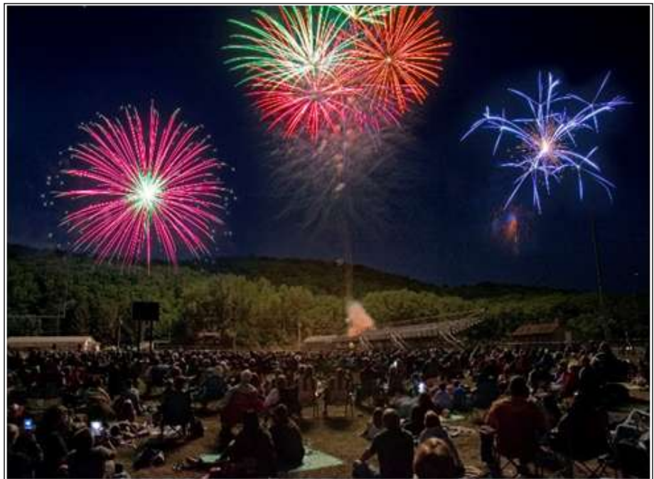
amRadio (below) entertained the crowd, in Tunkhannock on July 3 rd followed by the spectacular fireworks display (above).

The spectacular fireworks display that culminated the evening was orchestrated by ZY Pyrotechnics LLC. The fireworks were visible from many locales around the